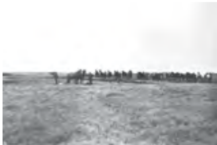
Visual: Prairie Environment.