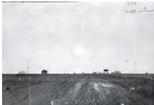
Photograph #LH5134a