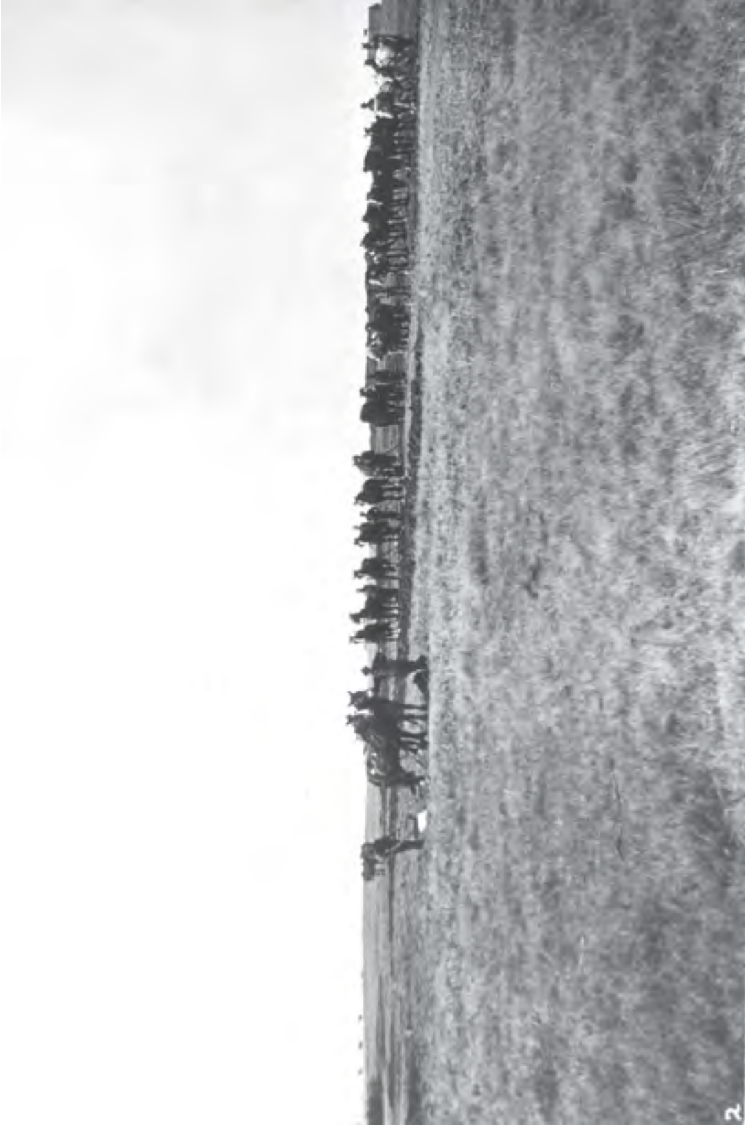
Visual: Prairie Environment. University of Saskatchewan 1910