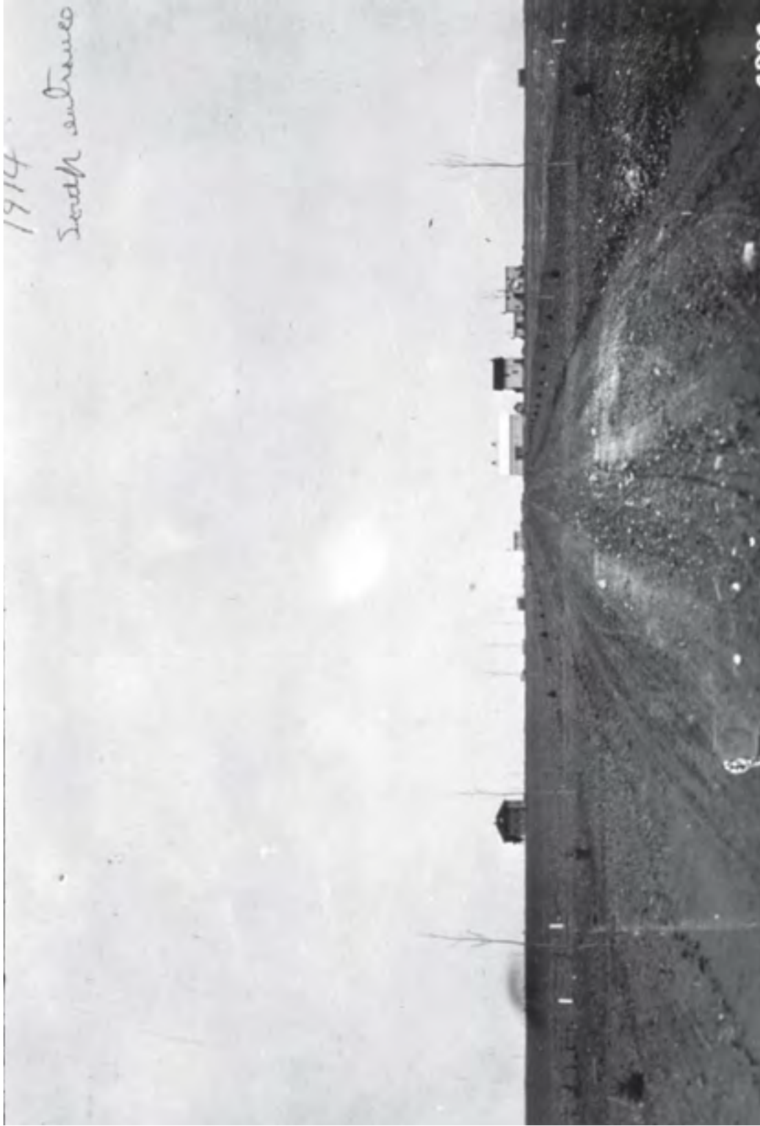
Visual: 1914 Picture of the house Photograph #LH5134a courtesy of Saskatoon Public Library Local History Room