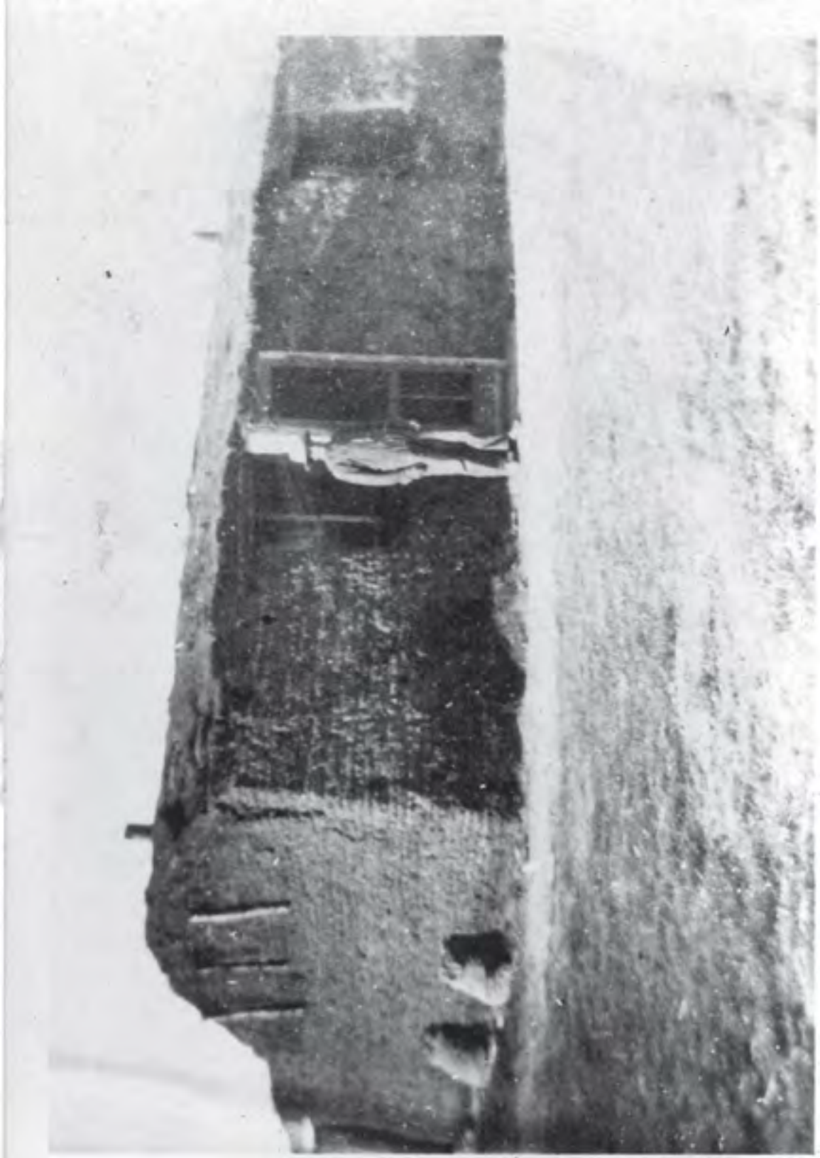
Visual: The McLean Sod House at Zealandia (with the hired man outside) Photograph #9461 courtesy of Saskatoon Public Library Local History Room.